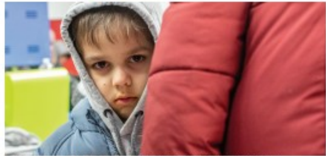
A young boy in the Kraków Główny Main Station after arriving from Ukraine.